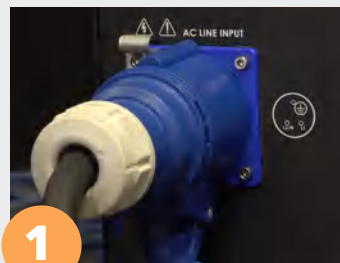
1 220 V Power