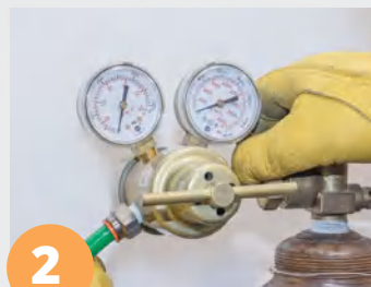
2 Standard Gas