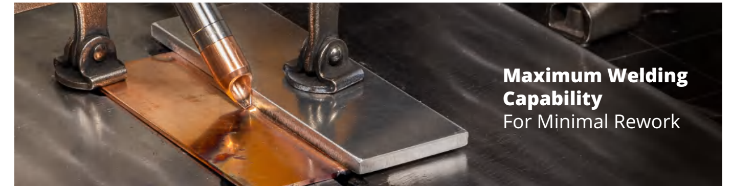
Maximum Welding Capability For Minimal Rework

LightWELD built-in optimized presets provide high-quality, consistent welds for any skill level. LightWELD XC and LightWELD XR offer the added functionality of pre- and post-weld cleaning. Pre-weld cleaning removes oil, grease, paint, or any potential contaminants that can affect weld quality. Post-weld cleaning creates visually appealing welds while eliminating need for post processing