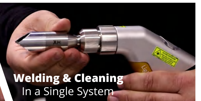
Welding & Cleaning In a Single System

Switching between welding and cleaning is fast and easy. Simply loosen the collet, insert the welding or cleaning nozzle, select a preset from the front panel, and the system is ready to clean or weld.