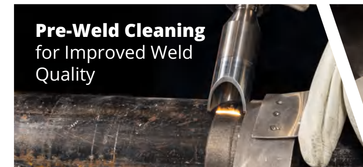
Pre-Weld Cleaning for Improved Weld Quality

LightWELD XR easily welds steel, stainless steel, aluminum, titanium, copper, and nickel alloys without part deformation. Preset modes ensure proper laser settings for consistent high-quality welds. Built-in wobble function accommodates wider seams, while wire welding capability extends welding application to poorly fit up parts.