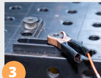
3 Workpiece Clamp

Clearly labeled rear connections make getting started fast and easy. Just plug in the power cord and gas connection, attach the workpiece clamp, and the system is ready to go. Laser power, gas and gun control is delivered through a single cable. An ethernet computer connection provides access to advanced settings to fine tune and save process parameters.