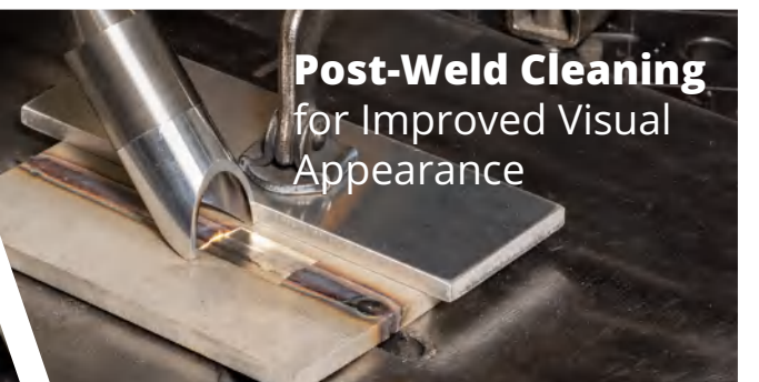
Post-Weld Cleaning for Improved Visual Appearance

LightWELD is powerful enough to melt metal and create a weld pool even if contaminants are present. However, to improve weld quality and reduce porosity, best results are attained by pre-cleaning to remove any oil, grease, or any debris that could enter the weld pool and create a defect.